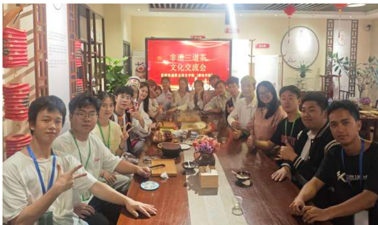
文化体验活动 Cultural experience activities