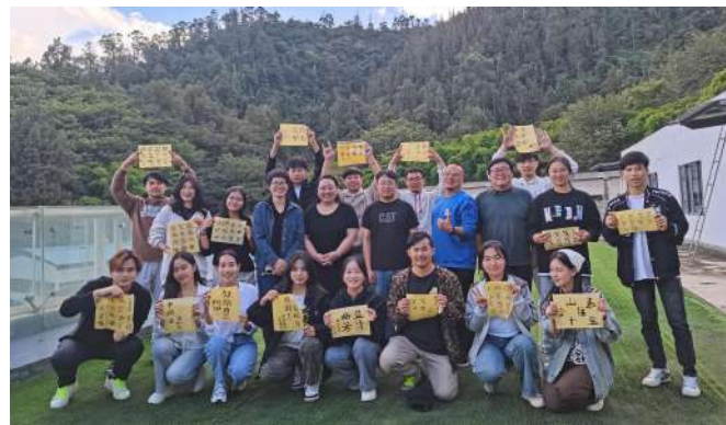
文化体验活动 Cultural experience activities