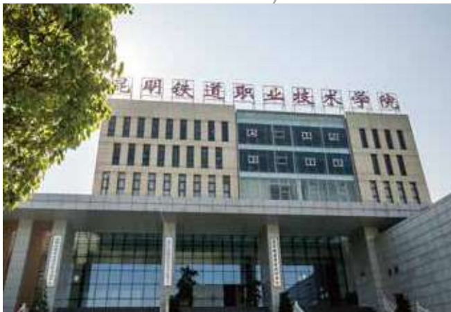
校园美景 Beautiful campus